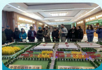
Learning the mechanism of crayfish-rice co-cropping