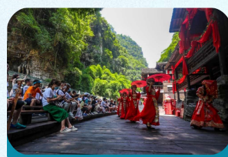
Experiencing traditional wedding ceremony