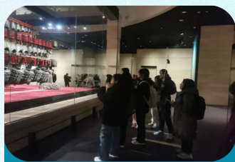
Observing chime-bells in Hubei Provincial Museum