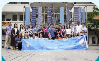
Participating in traditional printing and dyeing