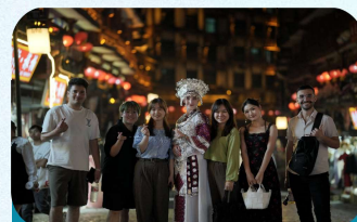
At Shibang Ancient Street