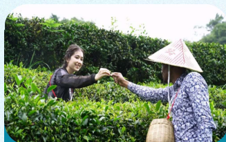
Camellia culture experience