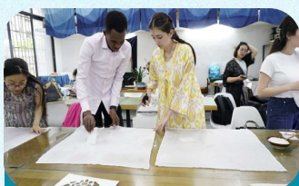
The site of the printing and dyeing event