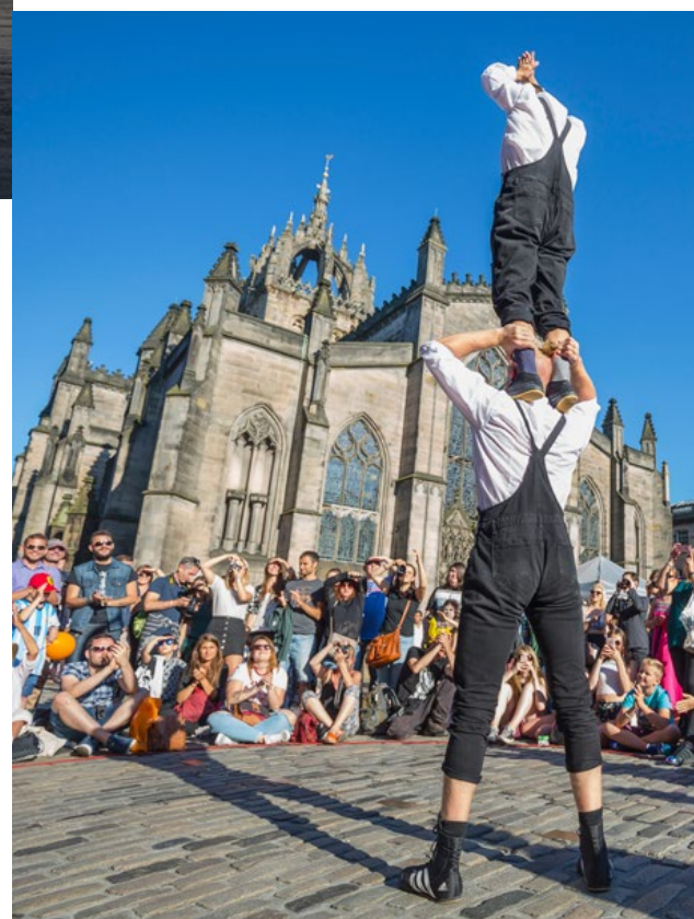
Performers, Edinburgh Fringe Festival.