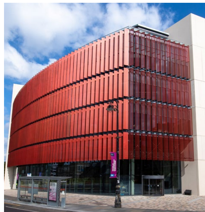
Our James McCune Smith Learning Hub at the heart of the main campus.

UofG's iconic Cloisters have appeared in many films and TV shows.