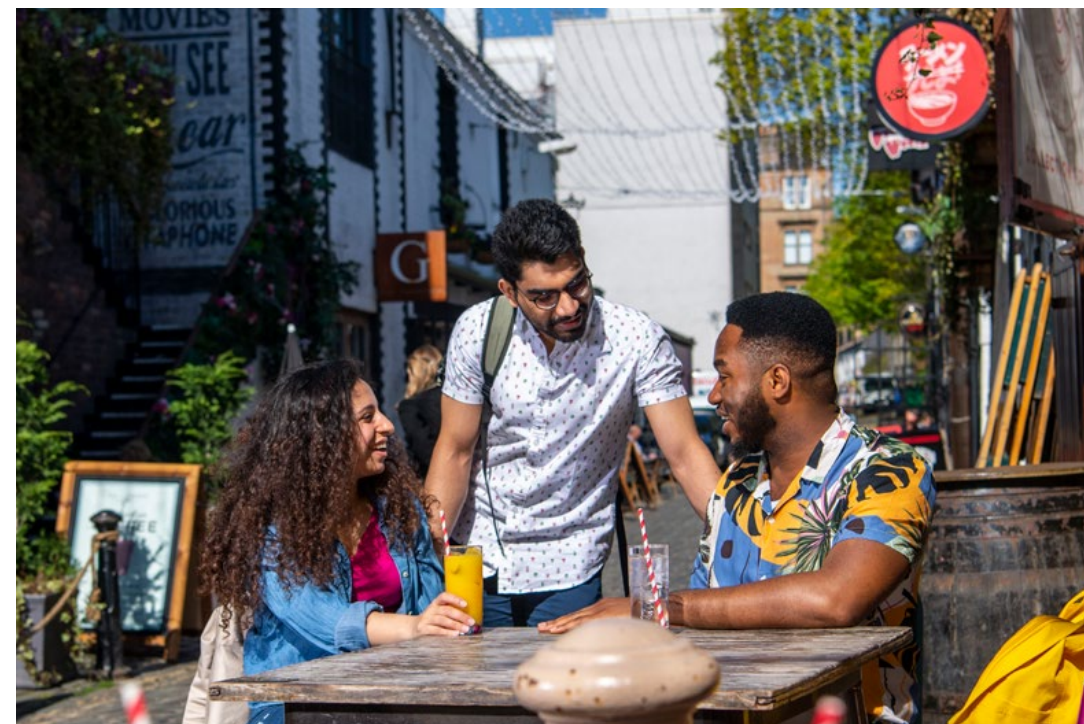
Ashton Lane, a lively cobbled lane next to the University which is packed with bars, restaurants and a cinema.

Glasgow is synonymous with sport. It became the European Capital of Sport in 2023, becoming the first city to take the title twice. In the same year the city also hosted the UCI Cycling World Championships. See visitglasgow.com