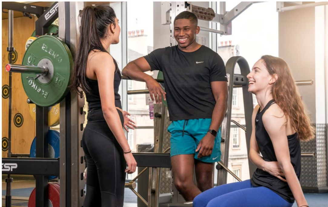
Over 50 sports clubs cater to all skill levels and abilities.