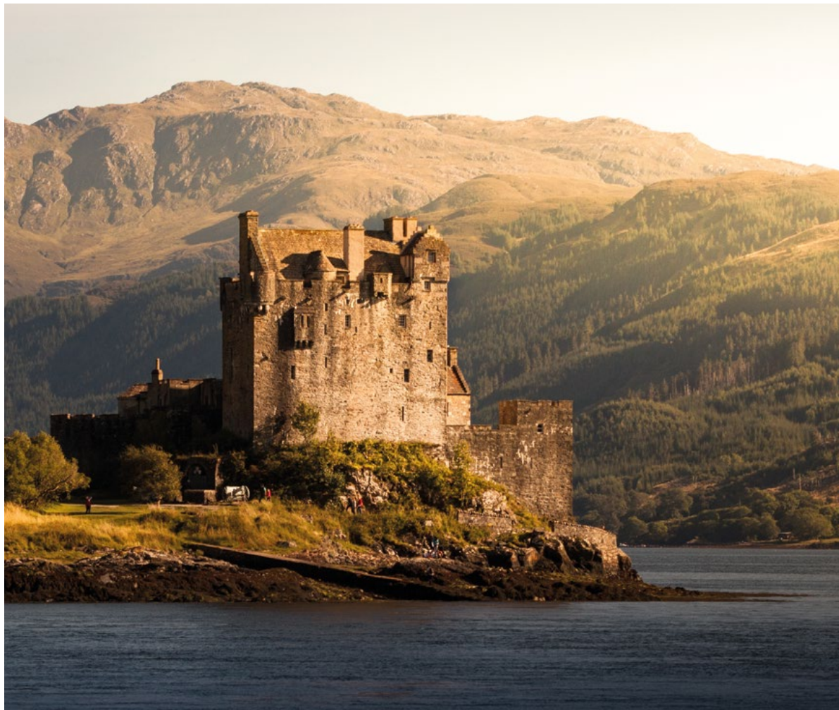
Eilean Donan Castle, Loch Duich.