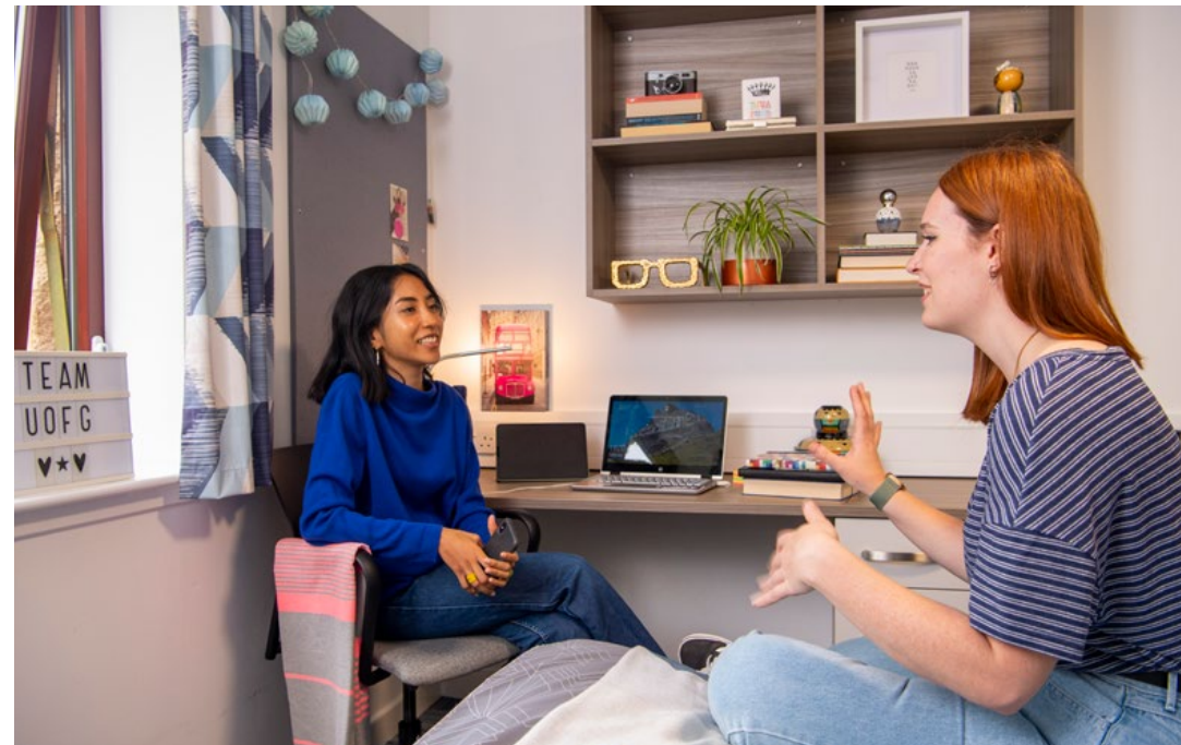
Accommodation Services offer a variety of residences and room types to choose from.