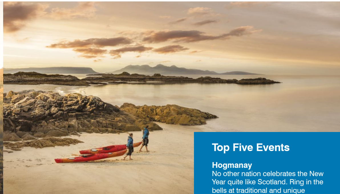
Camusdarach beach, Arisaig, Scottish Highlands.

Scotland has played a starring role on the big and small screen, as the filming location for top films and TV shows including Outlaw King , 1917 , Skyfall , Harry Potter and The Batman . In fact, the University itself is frequently used as a filming location and has featured in several episodes of Outlander . See visitscotland.com