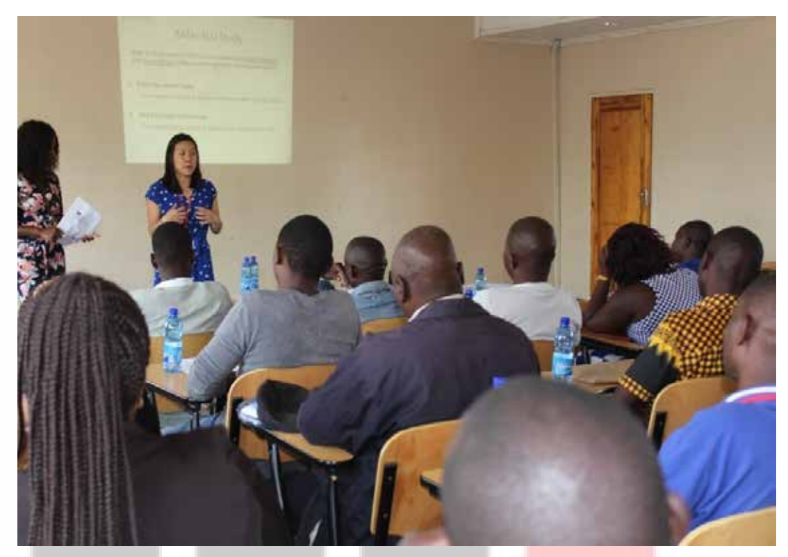
Sharing of study findings calls for intervention to prevent future harm - Ho

"608 adults (59% HIV-infected) were recruited from the QECH ART and VCT clinics. In the two-year follow-up period, HIV-infected adults were found to have a three-fold increased risk of laboratory-confirmed influenza illness, compared to HIV-negative adults". Antonia said.