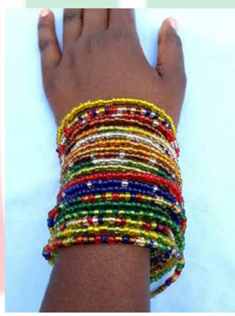
Chibangili- Bracelet. Derived from the English word 'Bangle'.